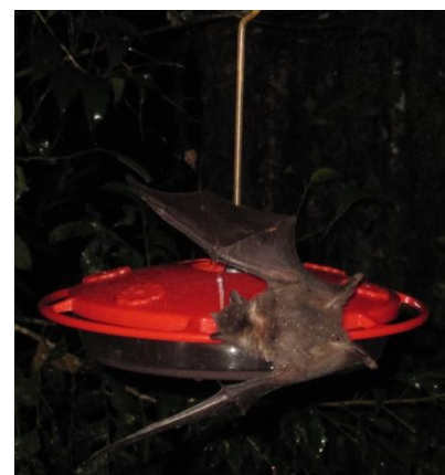
Geoffroy's hairy-legged bat; note absence of tail membrane, and hairy legs!