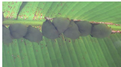
Honduran white bats, lesser white-lined bat, red-eyed leaf frog