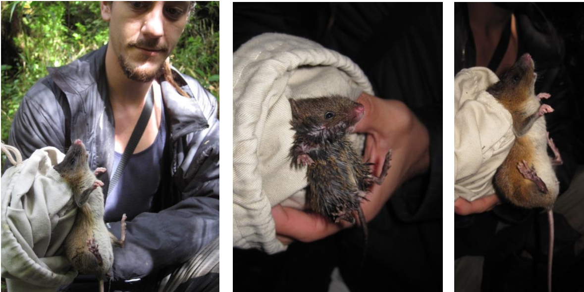
José Ramirez-Fernández, Peromyscus nudipes, Chiriquí singing mouse, montane rice rat

seen (we found a cottontail latrine in páramo flanking the side-road that leads up to the communications towers about 15km SE of Iyok Ami , but despite an hour's spotlighting that night failed to see any rabbits).