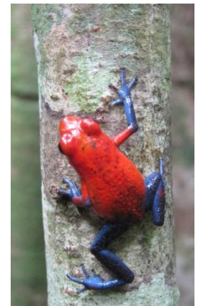
green and black and strawberry poison frogs