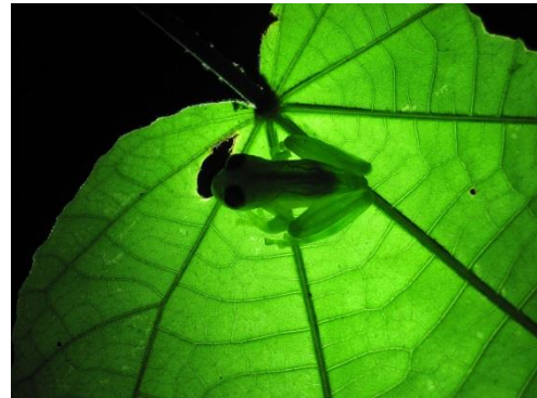
speckled glass frog

Costa Rica was amazing, with a staggeringly diverse fauna, and guides who were consistently fantastic. We focused our trip on mammals, but also saw a tremendous diversity of birds, some extraordinary frogs and reptiles, and a lot of impressive insects, crabs and spiders (not to mention mangroves, bromeliads, high-altitude páramo...). The variety of bats was particularly striking, and meant that without being unusually lucky we still managed to see many species, nearly all of which were new for both of us.