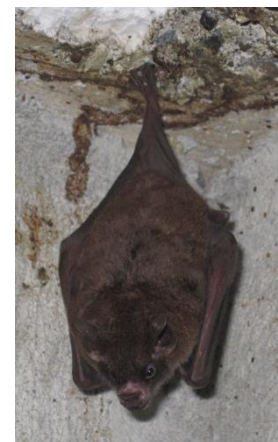
chestnut short-tailed bat

Lesser white-lined bats were easily found roosting during the day: in a rest-hut by the gravel path (soon after the left bend by the green gate), in the armpit of a tree at the research station end of the suspension bridge (to the left of the bridge as you face the station clearing, in one of the first large trees after the bridge reaches the bank), and in the walled-off structures under our accommodation block, where we also found Seba's and chestnut short-tailed bats . White bats are currently quite hard to find in the area, despite being present (hence our trip to Pierella Gardens later on). We also saw a very small bat (smaller than a common pipistrelle) in the forest, but don't know what it is likely to have been. Collared peccary are abundant in the research station clearing at the end of the bridge.