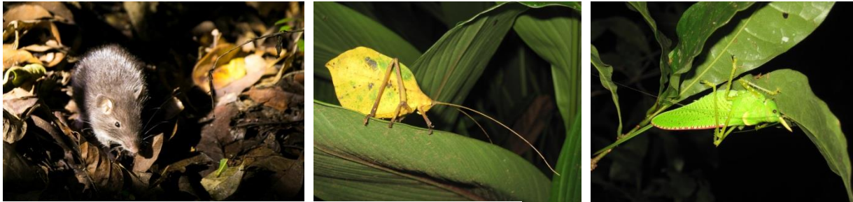
forest spiny pocket mouse and some brilliant crickets

Over the next two days we took morning walks around Monteverde Cloud Forest Reserve and Curi-CanCHA Reserve , both of which had great birds (including quetzals and trogons ), but mammals were pretty difficult, not helped by large amounts of rain! However, we did find some Spix's disk-winged bats in the bananas near the lookout in Curi-CanCHA . Red-tailed squirrel and agouti were also around, as well as one variegated squirrel in Monteverde village. There was also a three-wattled bellbird calling behind Stella's Bakery .