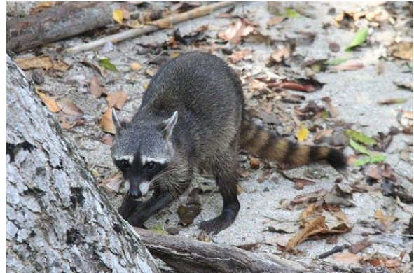
Manuel Antonio raccoon

Manuel Antonio is a strange place, and a combination of hordes of tourists and a somewhat disappointing time with Ave-Natura meant it was our least enjoyable stop. Red-backed squirrel monkeys, white-faced capuchins, howler monkeys, agouti and three-toed sloths were all easily seen in the National Park - as were a group of picnic-raiding raccoons at the beach. We are still unsure of what species these were – they had obviously black legs, reddish tails and a dark appearance overall, but the fur didn't appear to be reversed on the neck, and the face-mask and behaviour were more like northern than crab-eating . We didn't take any pictures, but this image from Manuel Antonio matches closely what we saw. Please do get in touch if you have any suggestions, but looking at Arkive photos of crab-eating raccoons , and advice from Fiona Reid , we suspect these are also northern raccoons just with weird markings. We also found a Spix's disk-winged bat in a furred Heliconia just off the main road through the park. Finding somewhere to spotlight around Manuel Antonio proved somewhat tricky, but an accessible patch of habitat along the last part of the road leading to the Parador Hotel produced the only sloth we found for ourselves – a nice view of an active two-toed sloth .