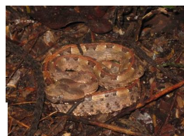
Spix's disc-winged bat, brown-throated three-toed sloth, rainforest hog-nosed pitviper